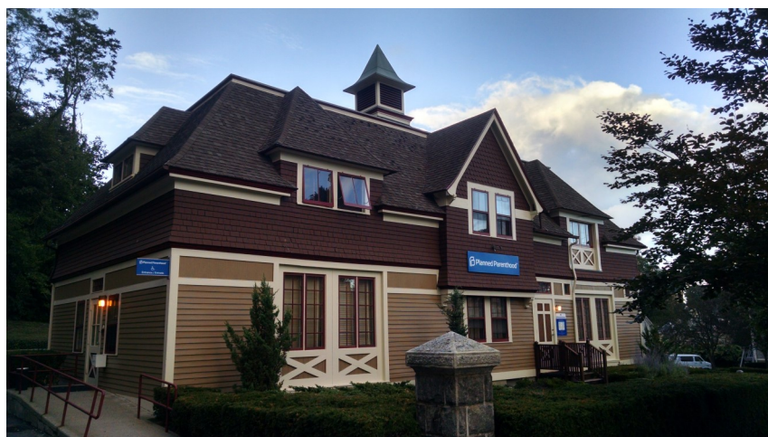
Restoration of the Palmer Estate Carriage House 45 Franklin Street