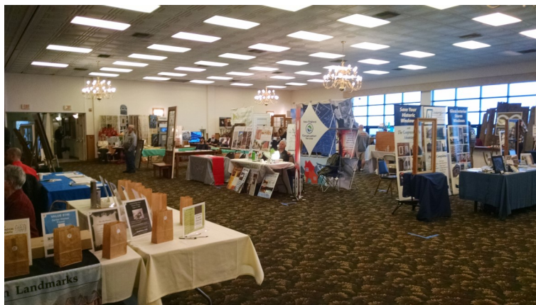
View of the showroom in the Port 'N Starboard, Ocean Beach Park