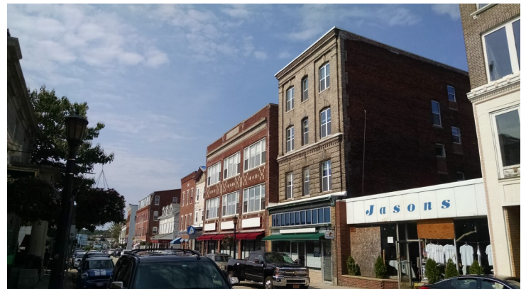
147 and 153 Bank Street