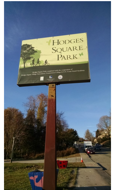
Sign for New Park