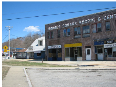
Hodges Square Before Fountain