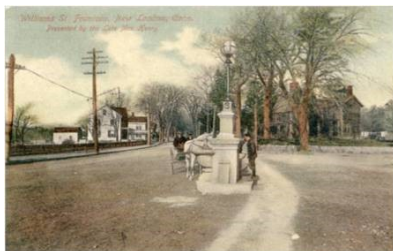
Hodges Square Fountain 1905