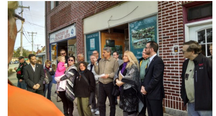
Former Mayor and HSVA

After many years of storage at the Lyman Allyn Art Museum, the historic monument was returned to its original location in Hodges Square. A ribbon-cutting ceremony was held on November 24, 2015.