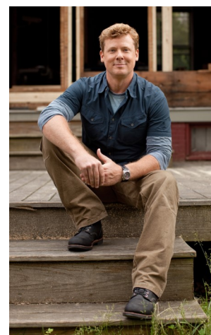
Kevin O'Connor Host, This Old House

Exhibitors and presentations by experts from New England including windows, paint, historic tax credits and more!