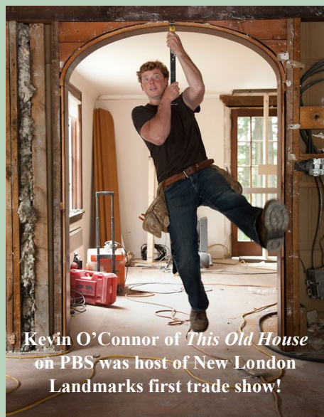
Kevin O'Connor of This Old House on PBS was host of New London Landmarks first trade show!